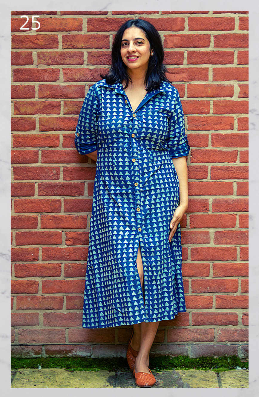
25. Patterned midi shirt dress