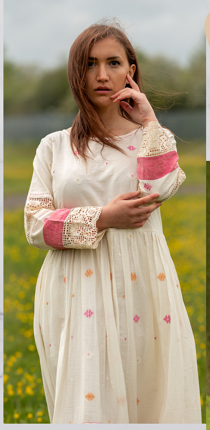
5. White dress with pink floral details and Lace accents

Jamdani is an experience! Handwoven soft cotton fabric along with a layer of handwoven intricate patterns embedded in the fabric. Handmade and sourced directly from the weavers using traditional methods.